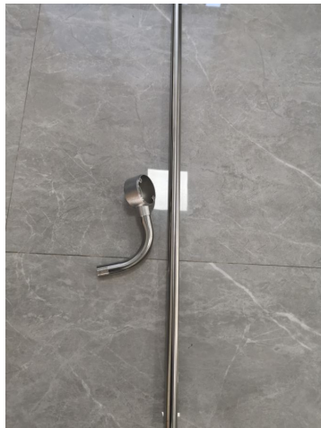
来样照片 Received Specimen