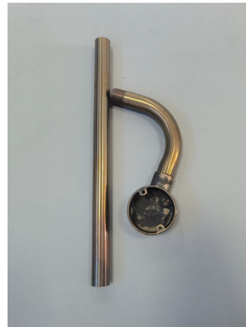
耐火试验-测试后 Fire resistance test - after test